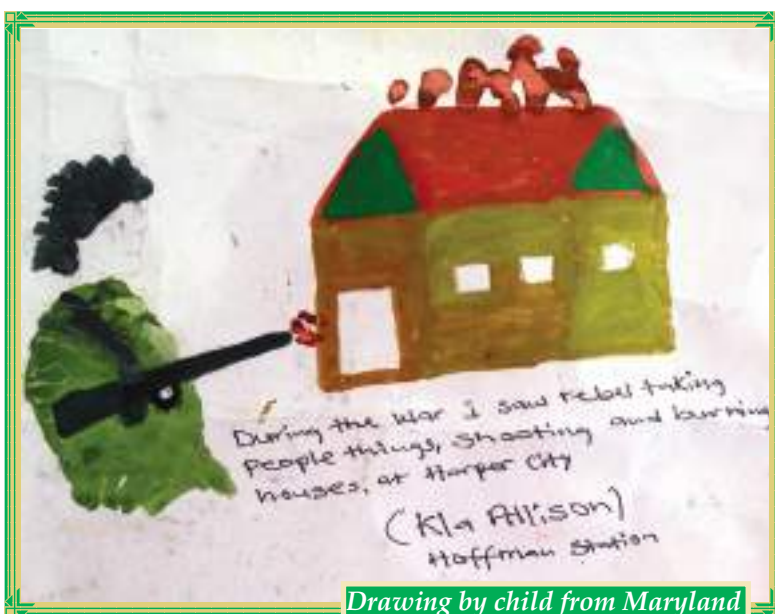
Drawing by child from Maryland County submitted to the TRC Children's Art Gallery

The above legal norms provide the backdrop for the detailed documentation and evaluation of children's experiences during the Liberian conflicts from 1979 to 2003. They also provide the framework within which to assess efforts undertaken so far by Liberia's post-war Governments to address the egregious violations of children's rights that occurred during the war and to include children in the process of rehabilitating and reconciling the devastated country.